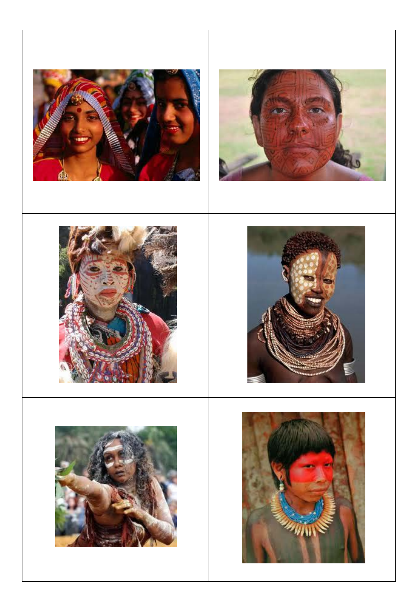
Based on activities from: Girls Get Real - Guides Australia and The Body Shop Self Esteem Activity Pack (1999)